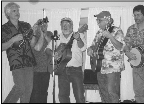
Cabin Fever entertains guests with lively music during the 2007 event.

Once Again area artisans, restaurants, businesses, and volunteers are coming together for the 6th Annual Empty Bowls™ Event to be held Sunday, April 27th, 11:00 am to 2:00 pm at the Park Place