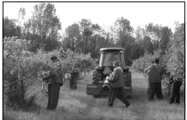
Camp Pugsley inmates harvesting apples.

Michigan State University Extension will be offering a certified Master Gardener Program to the inmates at the facility. Due to budget cuts, inmates will have to pay for the course themselves, donations are encouraged to assist with this program.